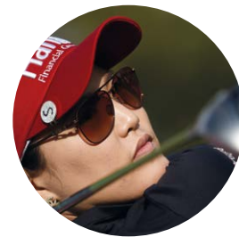
So Yeon Ryu

"This is a severely downhill par 3. It is extremely hard to gauge the distance and strength of the wind. Choosing the right club becomes a real challenge. The green slopes downwards with the upper tier to the right and the lower tier to the left. It is advisable to play past the pin and finish with an uphill putt, which is easier."